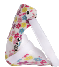
Night Stretching Strap AFO ○ ○ ●