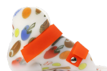
Max Control SMO ○ ○ ●