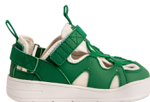
Sandals Available in sizes 3T - 3Y