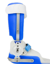
Spring Flex AFO ○ ○ ●