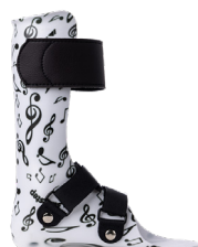
Advanced AFO ● ○ ○