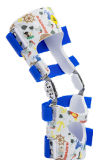
HEKO (custom) ○ ● ○

Scan the QR code to explore all lower extremity orthoses.