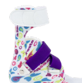
2 Stage AFO (PLS) ● ○ ○