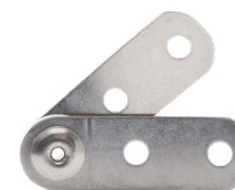
Free Motion Hinge