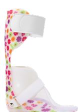
Posterior Leaf Spring AFO ○ ● ●