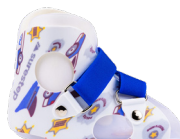
Big Shot Lite SMO ● ○ ○