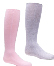
Surestep Socks SMO, AFO, KAFO Available in white, black, pink, and gray (premium)