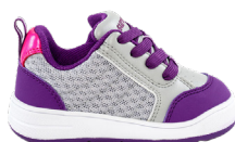
Toddler Shoes Available in sizes 3T - 9T