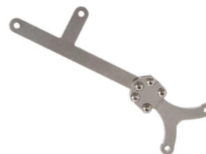
Dual Adjustable Hinge