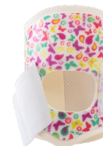
Thoracic- Lumbar-Sacral Orthosis