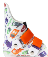
Toe Walking SMO ● ○ ○