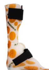
Solid AFO ○ ● ●