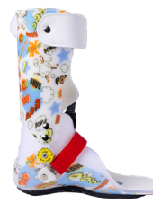
DASS AFO ○ ○ ●