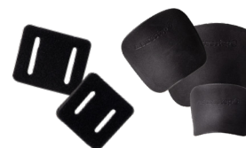
Neoprene Pads & Dorsal Pads