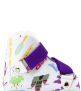
Surestep SMO ● ○ ○