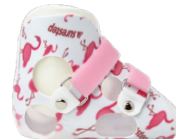
Big Shot SMO ● ○ ○