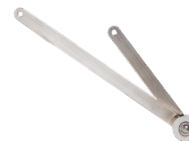
Spiro Joint Non-weight bearing joint