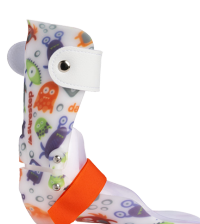
Articulated AFO ○ ● ●