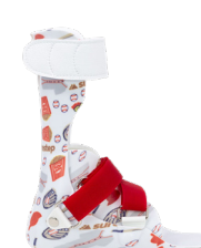
2 Stage AFO (solid) ● ○ ○