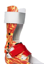
2 Stage AFO (articulated) ● ○ ○