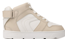
Heel Entry High-Tops Available in sizes 3T - 3Y

Our orthotic-friendly shoes and socks are specifically designed to fit over Surestep braces. They help keep orthoses in place while encouraging active play and everyday movement. Available in a variety of fun designs, they support mobility without compromising style or comfort.