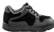
Youth Shoes Available in sizes 10Y - 3Y