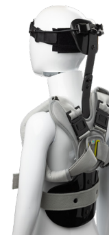
DCO Dynamic Cervical Orthosis